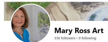
Mary Ross Art 336 followers • 0 following